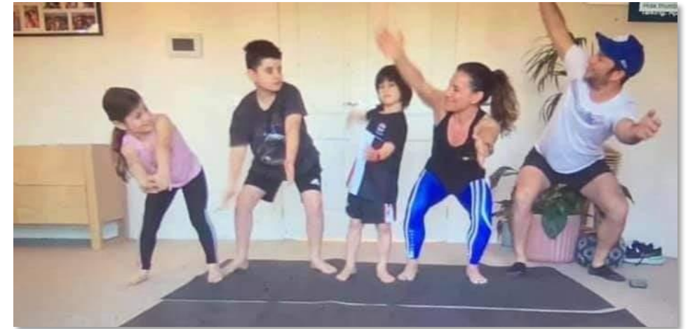
Online Fitness Sessions