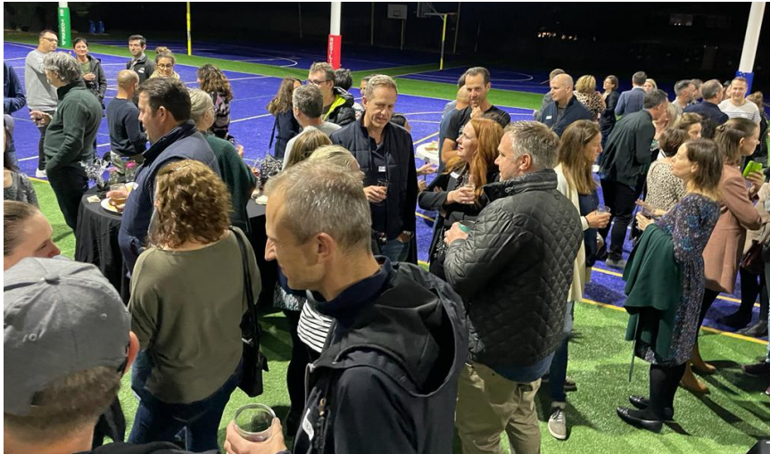
Wine and Cheese Night