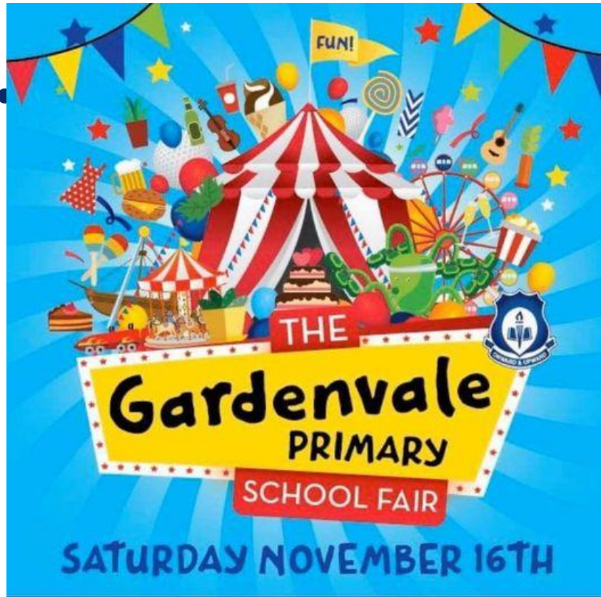
School Fair Extravaganza