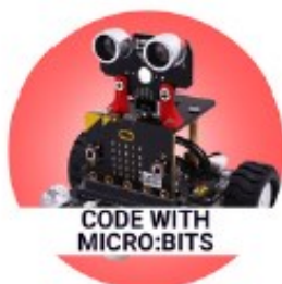
CODE WITH MICRO:BITS