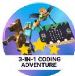
3-IN-1 CODING ADVENTURE