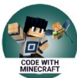
CODE WITH MINECRAFT

JOIN US FOR EXCITING NEW CAMPS THIS SCHOOL HOLIDAYS!