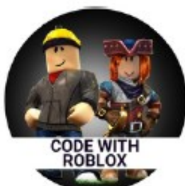
CODE WITH ROBLOX